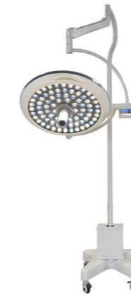
E700 Internal Camera