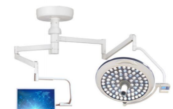
E500 Internal Camera