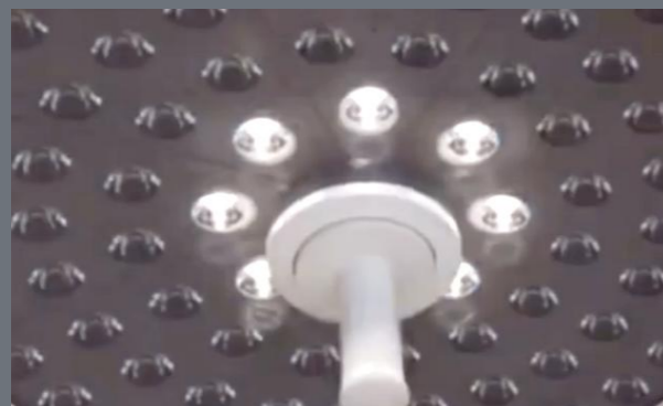
Endoscopy Mode In Deep Illumination For Various Operation Enviromental

Maximum illumination up to 180,000 lux Stable and constant illumination Enhanced visibility, diagnosis and treatment