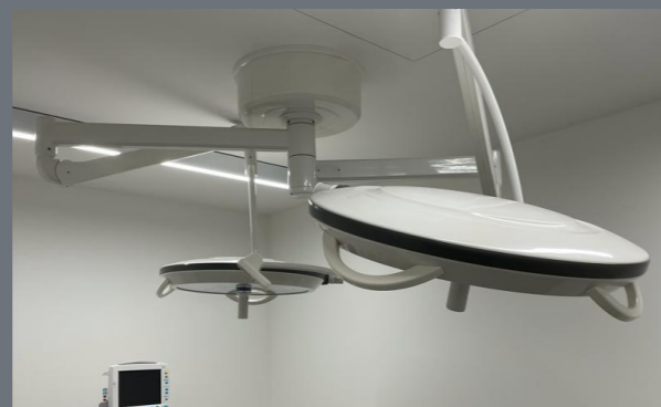
Astro Space Design, Working seamlessly with laminar airflow solutions