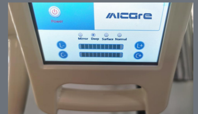
5.1 INCHES LCD Touch Panel Optional (OEM With LOGO Print Available)