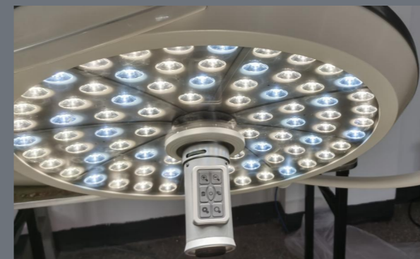
Removable Sterilizer Handle Can Be Easily For Internal Camera