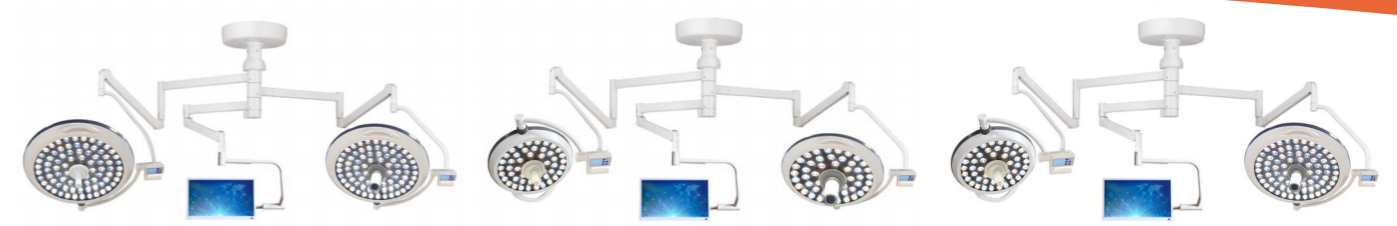
E700/700 Internal Camera