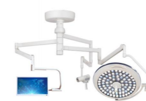
E700 External Camera