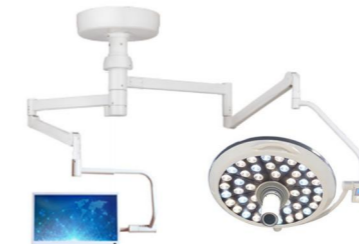
E700 Internal Camera