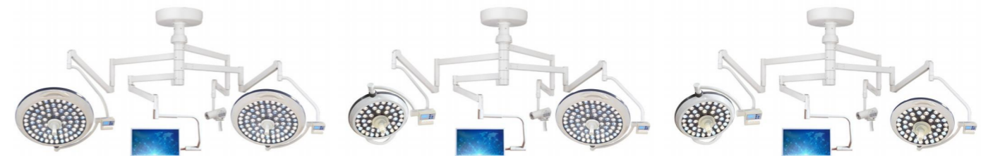
E700/700 External Camera