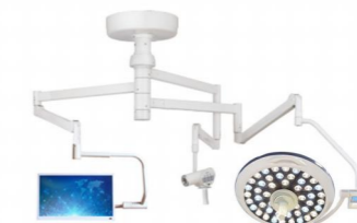
E500 External Camera