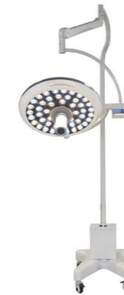
E500 Internal Camera